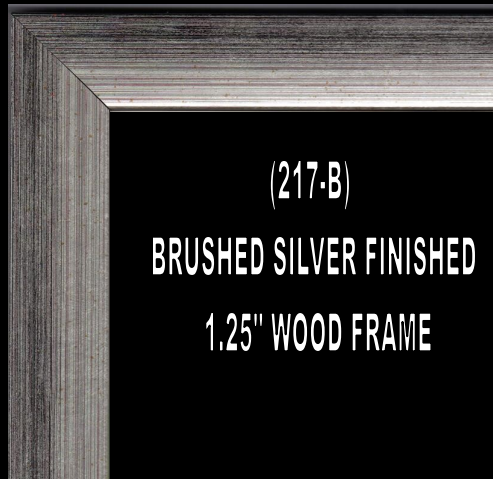
(217-B) BRUSHED SILVER FINISHED 1.25" WOOD FRAME

(3) Double Matted Giclee' Prints on 61# Acid Free Paper with Certificate of Authenticity.